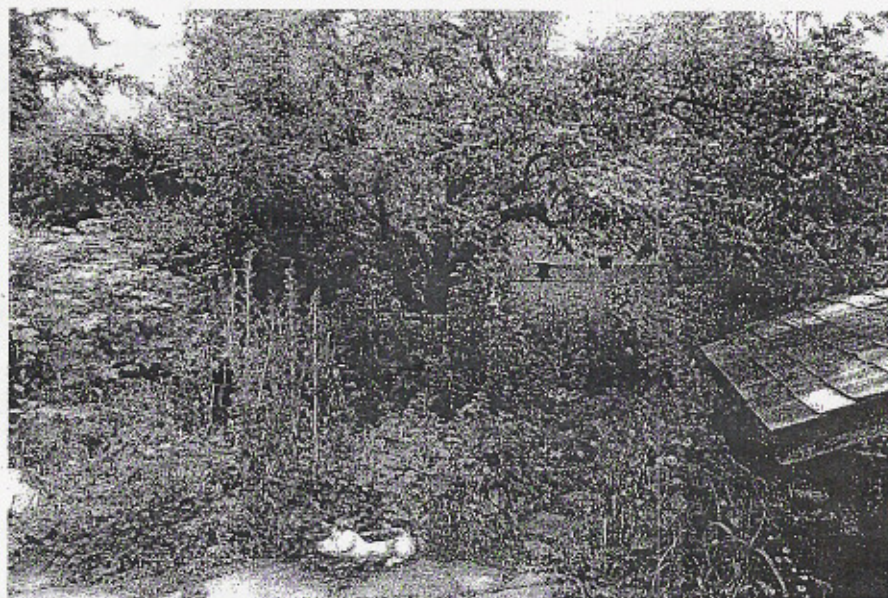
The Oasis, Bellingham, WA

A sustainable and productive way to grow healthy food